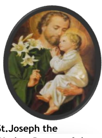
St. Joseph the Worker-Patron of the Brothers of St. Joseph the Worker.